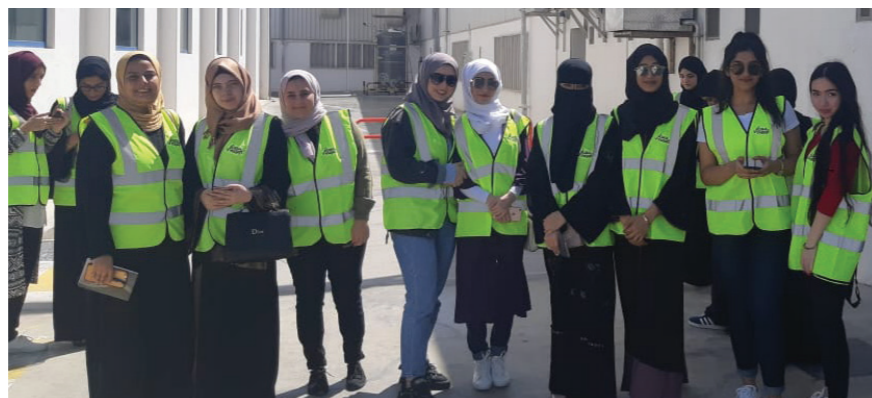
Tuesday, Apr 16, 2019 Location | Masafi Water Plant - Masafi, Ras Al Khaimah, UAE