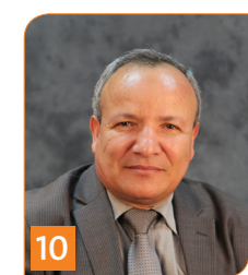
Acting Vice Chancellor for Academic Affairs