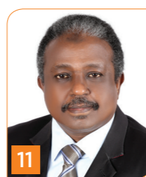
Vice Chancellor for Administrative and Financial Affairs