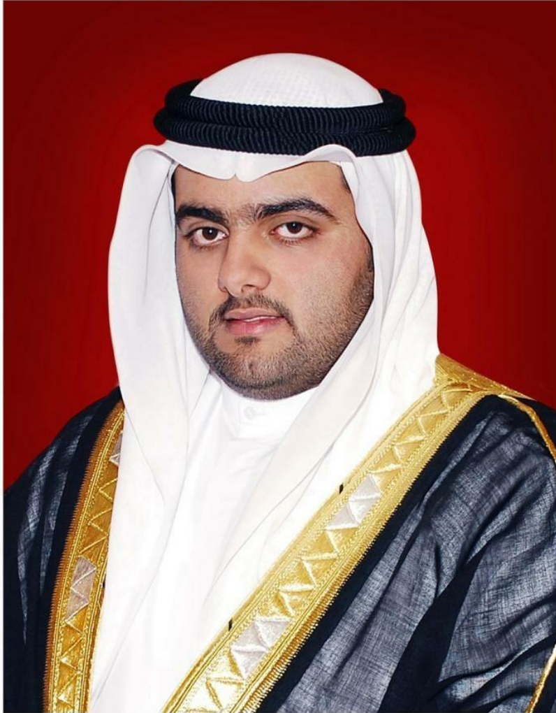
شمو السني محمد بن محمد بن محمد الشرفي ولي عهد إمارة الفجيرة