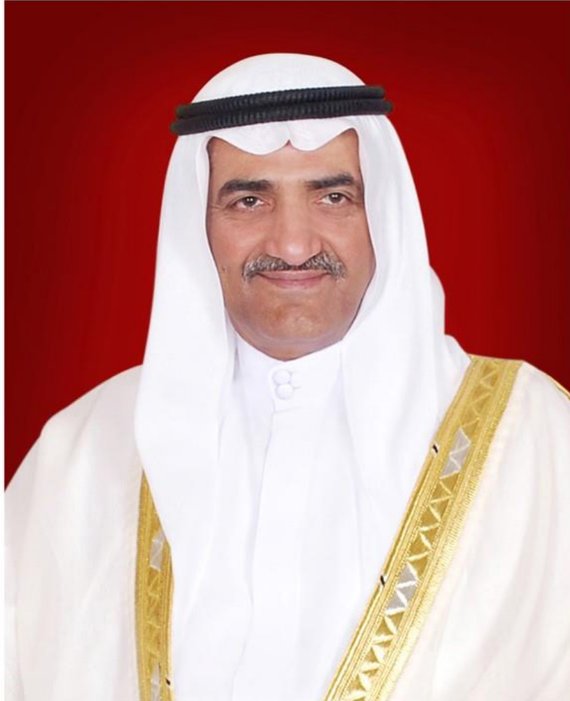
صاحب السمو الشيخ محمد بن محمد الشرفي عضو المجلس الأعلى حاكم الفجيرة